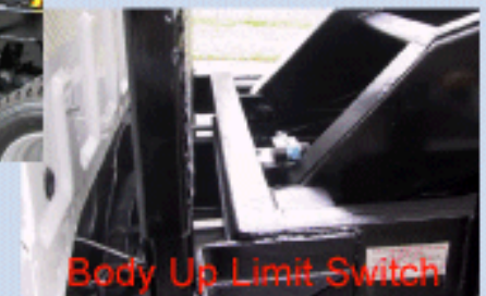
Body Up Limit Switch